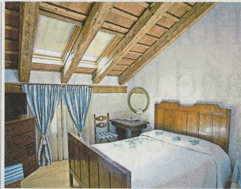
Elegant Ca' de Memi, right; and pasta-making at Alla Madonna del Piatto, right

● Double rooms are available from €90 per night, including breakfast (0039 0758 199050; sawdays.co.uk/agriturismoallamadonna).